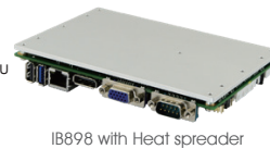
IB898 with Heat spreader