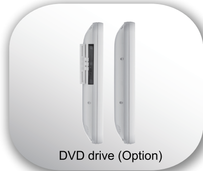
DVD drive (Option)